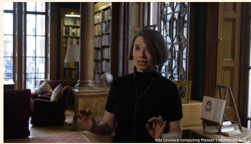
PRODUCER & CAMERA OP.